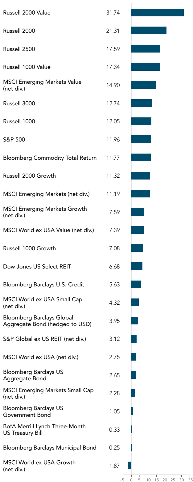
Major World Indices Ranked by One-Year Performance (%) As of December 31, 2016

Past performance is not a guarantee of future results. In US dollars. Indices are not available for direct investment. Performance does not reflect the expenses associated with management of an actual portfolio.